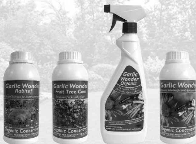
MISC535 Garlic Wonder Rabbitof 500ml £14.99

These new products are for gardeners who want to use natural solutions to grow their plants. They are a unique blend of aqueous extracts of garlic and natural ingredients that produce no chemical residues, are safe to use and safe in the environment where people, pets and wildlife are present.